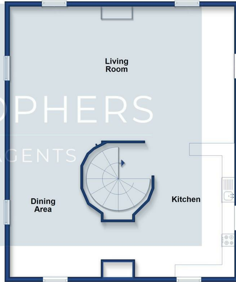
Total area: approx. 198.9 sq. metres (2140.6 sq. feet)